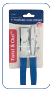
Twist & Out™ hanging packaging