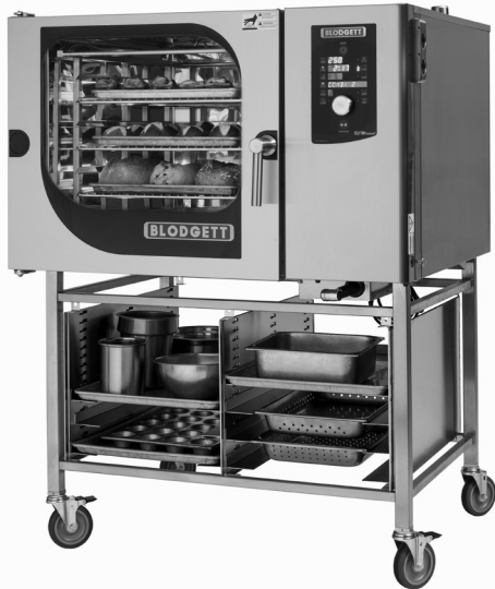
Shown on optional stand with casters