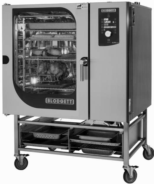
Shown on optional stand with casters