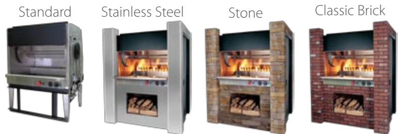
The Inferno WG is delivered to customers without a facade (left image). Customers have the option to install their own facades. The 3 images to the right are samples.

The WG is meant to be enclosed in a structure or behind a facade of your creation. Several examples below show what materials and looks can be achieved.