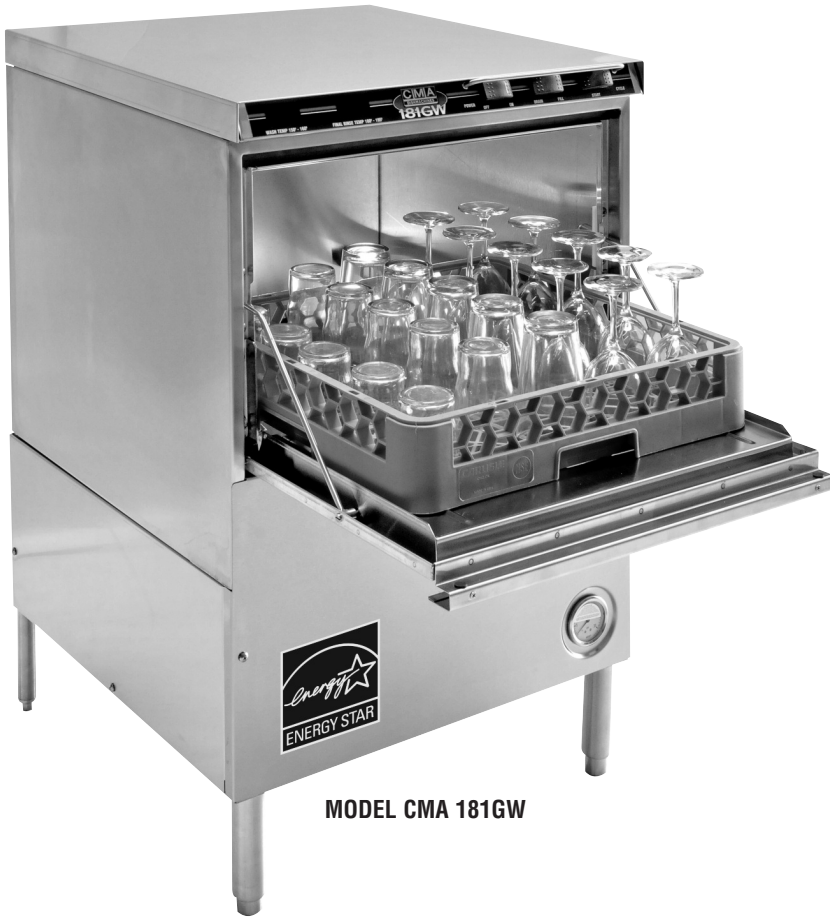
MODEL CMA 181GW