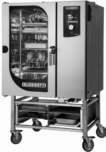
Shown on optional stand with casters

Refer to operator manual specification chart for listed model names.