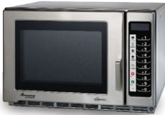
Model RFS18TS shown