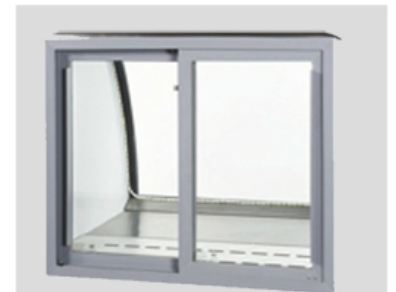
Self Closing Doors