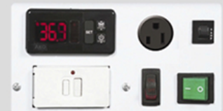
4 Amp accessory receptacle